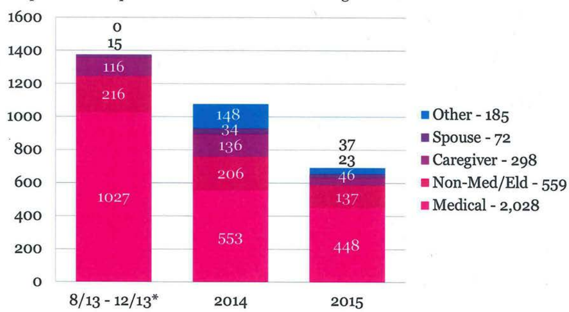
Graph 1. RIS Requests Filed At Facilities since August 2013

Regarding RIS requests filed at institutions, from August 2013 to December 2015, <sup>10</sup> there has been an overall decrease in the requests received. BOP facilities have received 3142 RIS requests in this time period. More specifically, 1,374 were received from August 2013 to December 2013, 1,077 were received in 2014, and 691 were received in 2015. Graph 1, below, shows the specific types of RIS requests filed each year.