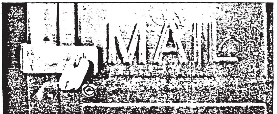
To help eliminate theft, an extra lock has been added on postal relay boxes.

post office last October when they first noticed there'd been no regu-